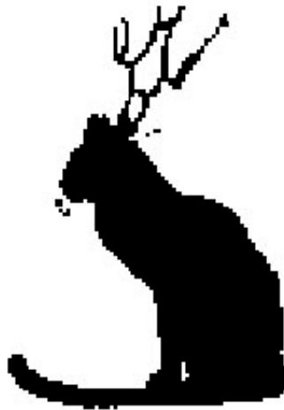
Figure 2: Administration

Part the hair on the cat's neck at the base of the skull until the skin is visible. See figure 2.